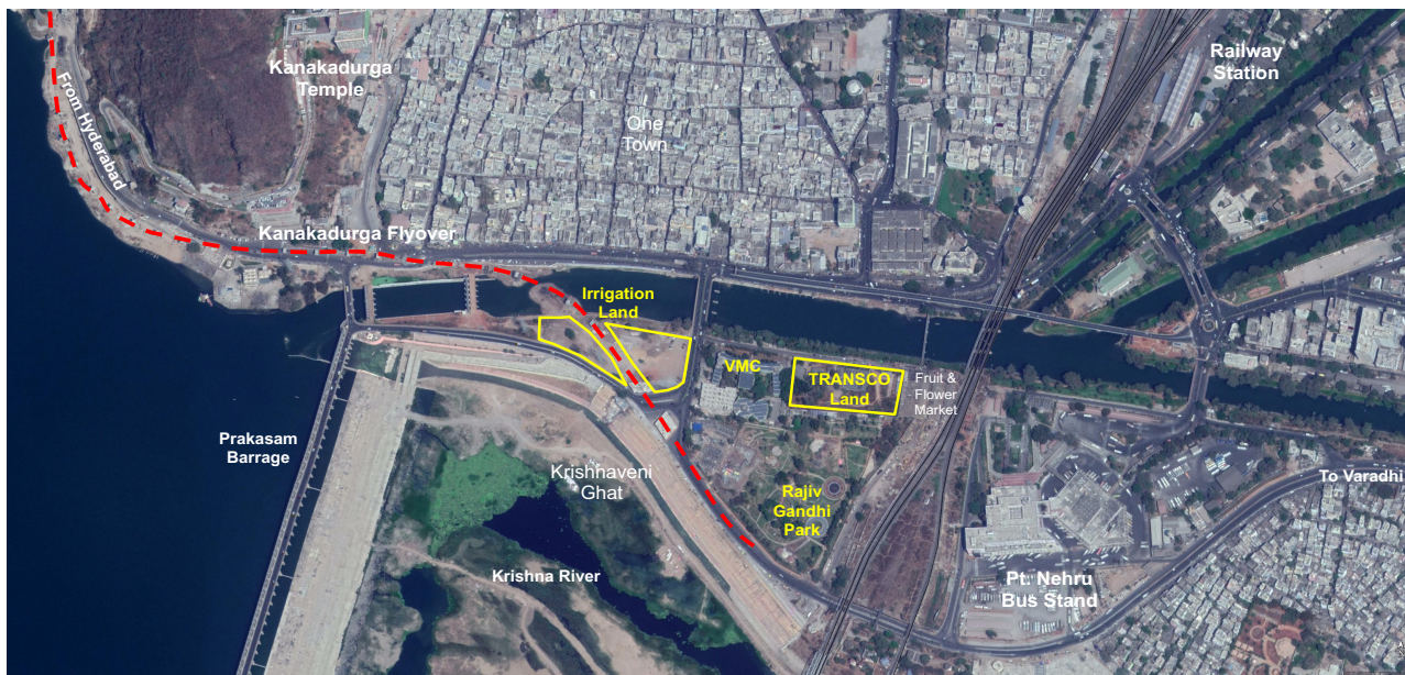
Figure 4: Proposed Sites for ‘Tourism Infrastructure Projects’ under “Vijayawada-Amaravati Gateway Projects”