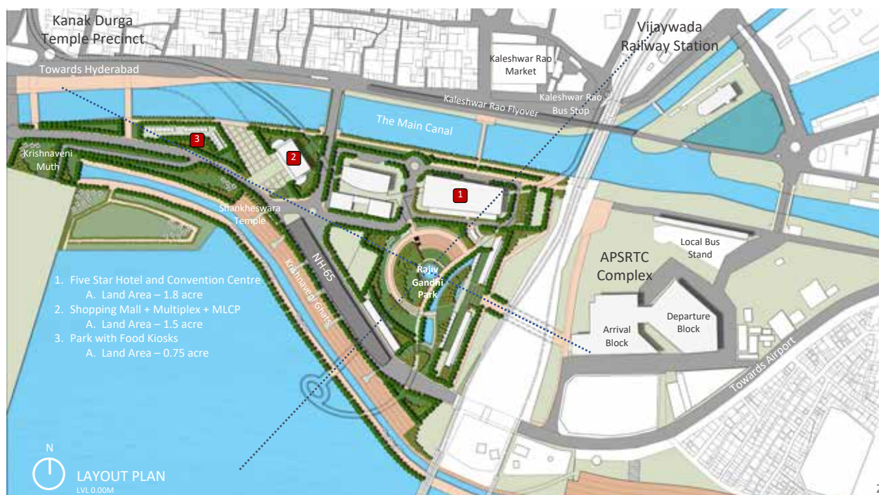
Figure 5: Proposed Conceptual Master Plan for 'Tourism Infrastructure Projects' under "Vijayawada-Amaravati Gateway Projects"